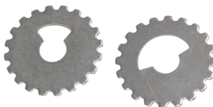
300 Series arc discs come in nine different selections

For maximum versatility covering varying landscape needs.